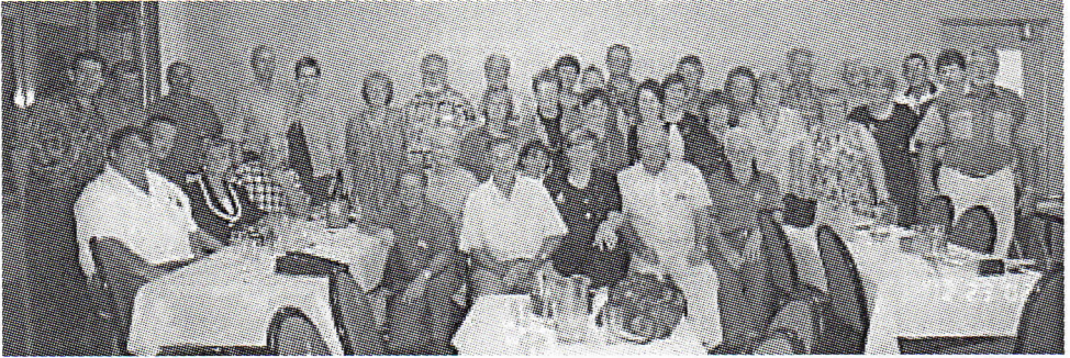
bove: A snap taken of a group made up from Wyong, The Great 8 and Moree members at a weekend they recently had at Nelson's Bay.